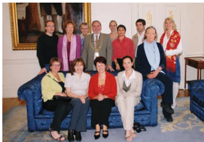
Members of CCN Task Group 8 meeting the Lord Mayor of Dublin, Ireland, to discuss Education for Sustainable Development.

The ESD seminars delivered by Task Group 8 members focus on the use of experiential methodologies that encourage Education for Sustainable Development rather than Education about Sustainable Development. In other words, active teaching and learning approaches (transformative methodologies) are used and promoted, rather than formal or traditional teaching and learning approaches (transmissive methodologies).