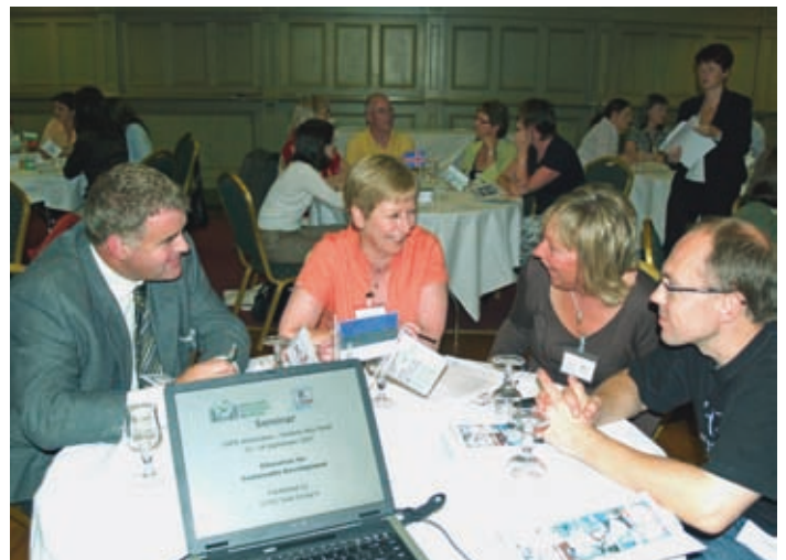
CCN Task Group 8 running an ESD seminar with Civic Social & Political Education (CSPE) facilitators, in Athlone, Ireland, 2007.

In our search for a sustainable future we need to redefine our position in relation to the environment. We cannot afford to continue to replicate our mistakes. We must search for better solutions based on ESD values and transformative learning approaches can help this process.